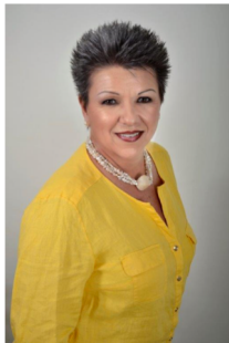
Lourdes Seda Realty